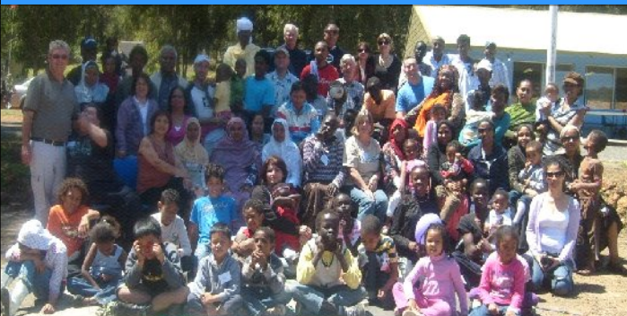
Harmony Weekend Group

"In Jamaica, when you dance, you move EVERYTHING YOU'VE GOT!"